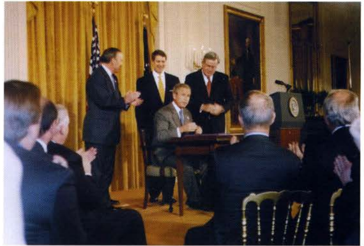
U.S. Commerce Secretary Don Evans, Senate Majority Leader Bill Frist and House Ways and Means Committee Chairman Bill Thomas look on as President George W. Bush signs historic tax cut legislation, containing unprecedented capital investment incentives.

Among the law's key provisions is a 50 percent bonus depreciation provision for printing, publishing and converting machinery and other capital equipment. NPES, working through the Cost Recovery Action Group coalition, had urged the